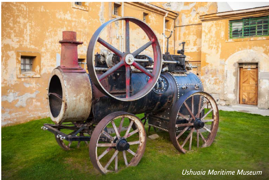
Ushuaia Maritime Museum

To discover the best options for extending your adventure, get in touch with your Travel Professional or a Polar Travel Adviser for seamless, worry-free booking of all trip extensions.